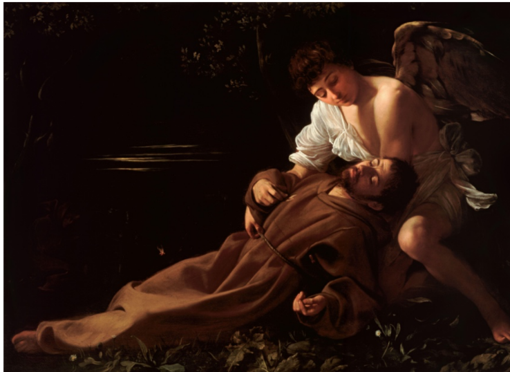
Saint Francis of Assisi in Ecstasy, Caravaggio c. 1595

Even as we commemorate the 800 th anniversary of the death of Saint Francis, we marvel at the extraordinary number of faithful making pilgrimage to Assisi to pray before his relics, exposed for veneration for the first time since his death. And even now, as we remember the Francis who traveled to Egypt to meet with the Muslim Sultan during the fifth Crusade to encourage peace, we ourselves beg the Lord for peace in this, our time of war.